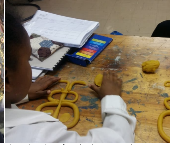
The end product of in school support and exercises that aim to develop gross motor development.