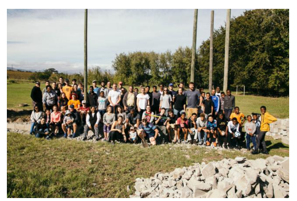
The group of all the volunteers of the second Serve Saturday at CA.